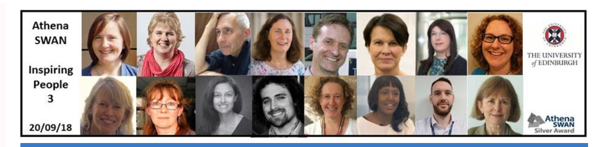
Click here to see the videos of Keynote Speakers and slides from CMVM Keynote Speakers